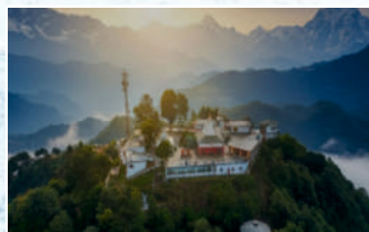
Maa Kunjapuri Devi Temple