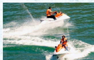
Tehri Lake Adventure