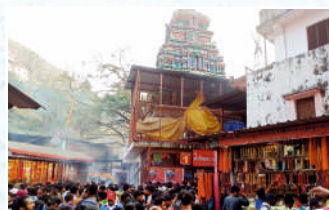
Neelkanth Mahadev Temple