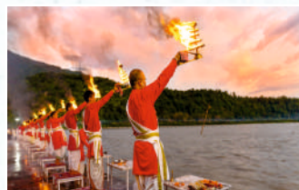
Triveni Ghat (Ganga Aarti)