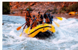
River Rafting Rishikesh