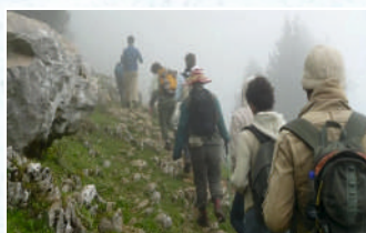
Trekking like Maa Kunjapuri Devi Temple